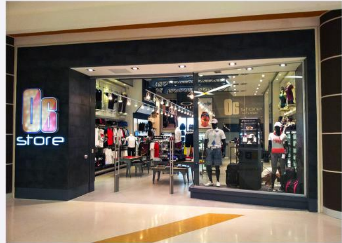
O6 Store, Dominican Republic