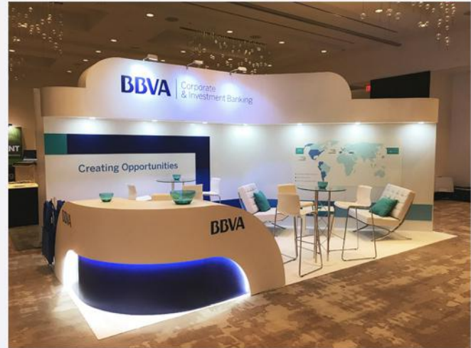
BBVA, Eurofinance 2017, Miami Beach, FL