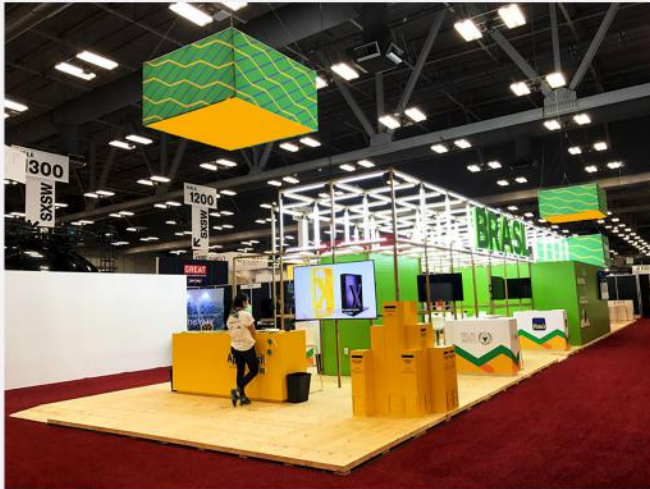
Be Brasil, SXSW 2017, Austin, TX