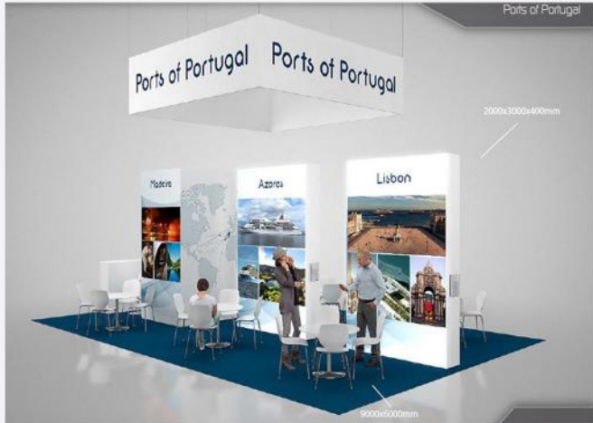
Ports of Portugal