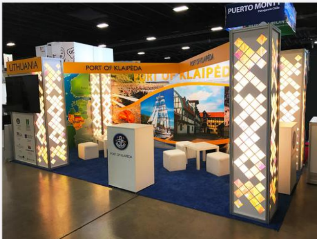
Klaipeda Port, Cruise Shipping 2017, Fort Lauderdale, FL