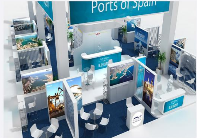
Ports of Spain