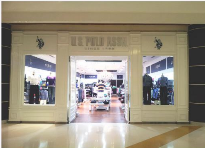
U.S. Polo Assn, Miami, FL