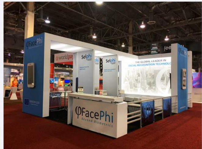
FacePhi, Money 2020, Las Vegas, NV