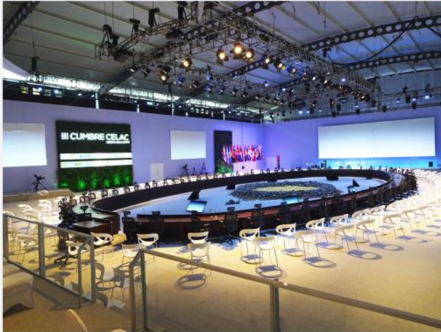
Cumbre CELAC 2015 , Costa Rica