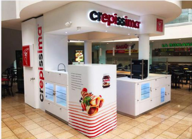
Crepissima, Costa Rica