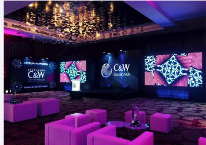
C&W Networking Event 2016, Costa Rica