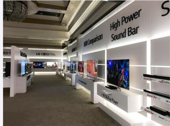
LG Innofest 2016, Miami, FL